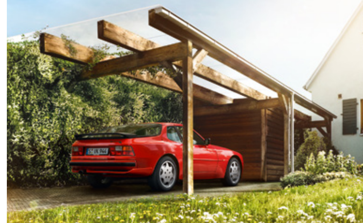
944 Model years: 1982–1991, examples produced: 163,302, available part numbers: 6,200