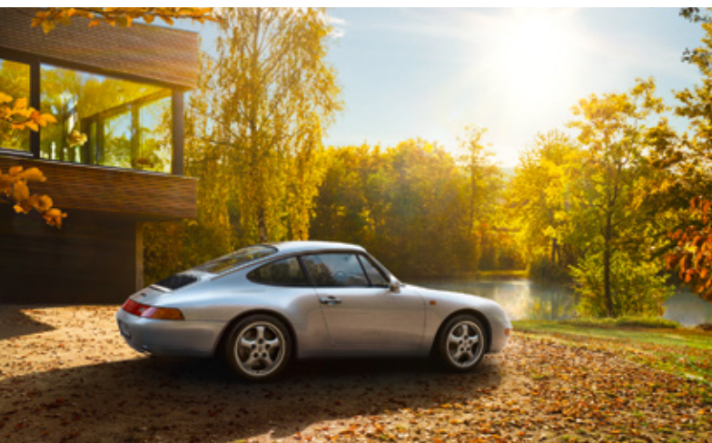
993 Model years: 1994–1998, examples produced: 68,881, available part numbers: 6,600