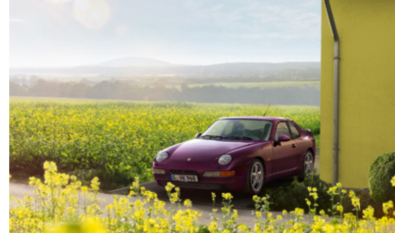
968 Model years: 1992–1995, examples produced: 11,248, available part numbers: 5,900