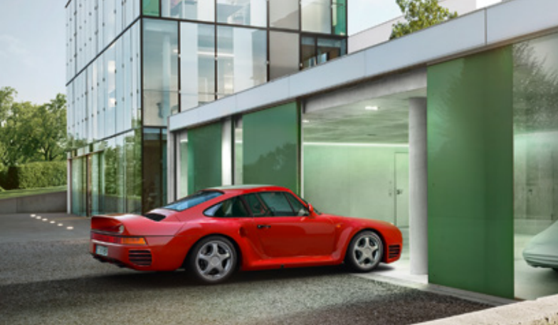
959 Model years: 1987–1988, examples produced: 292, available part numbers: 2,300