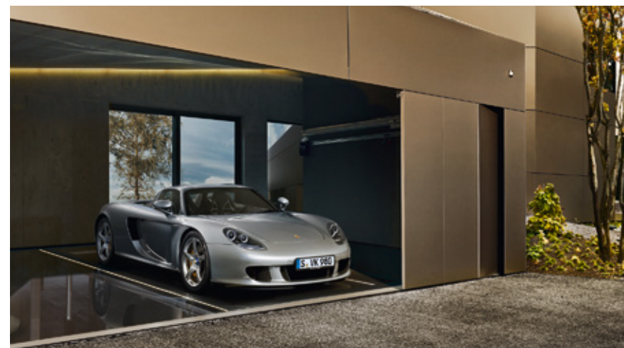
Carrera GT Model years: 2003–2006, examples produced: 1,270, available part numbers: 1,900

Porsche has been at the forefront of innovation for generations. Every vehicle has set the benchmark in its particular era.