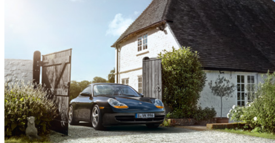
996 Model years: 1998–2005, examples produced: 175,262, available part numbers: 13,500