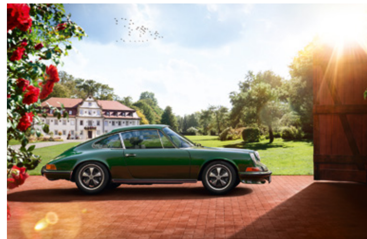
911 F Model years: 1965–1973, examples produced: 81,100, available part numbers: 3,500