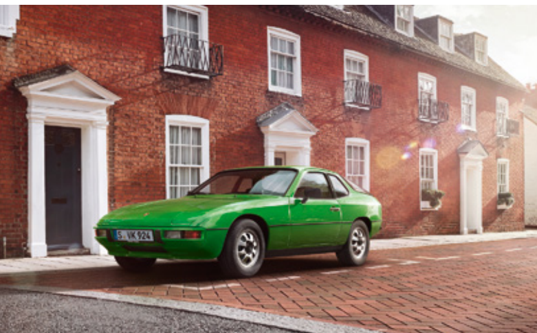
924 Model years: 1976–1988, examples produced: 150,684, available part numbers: 4,200