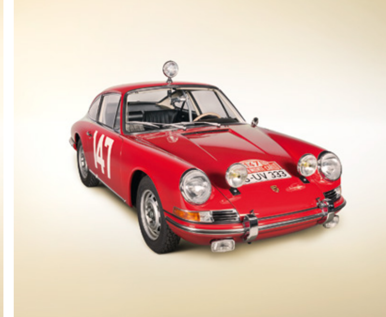
Before/after photos: Porsche 901, Monte Carlo Rally, Model Year 1965

In order to meet these requirements and to guarantee a consistent standard of quality around the world for all Porsche service and workshop staff, we've developed a special Classic training concept.