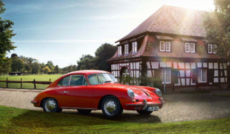
356 Model years: 1950–1965, examples produced: 77,766, available part numbers: 2,100