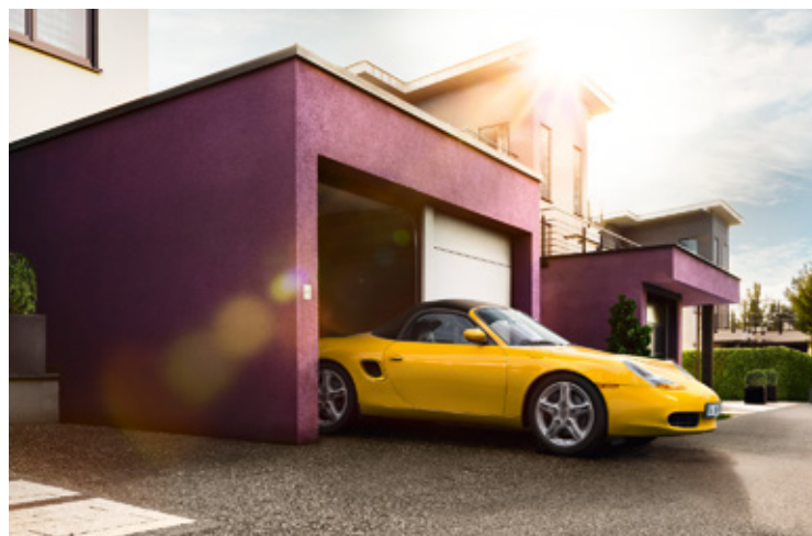
986 Model years: 1997–2004, examples produced: 164,874, available part numbers: 8,400