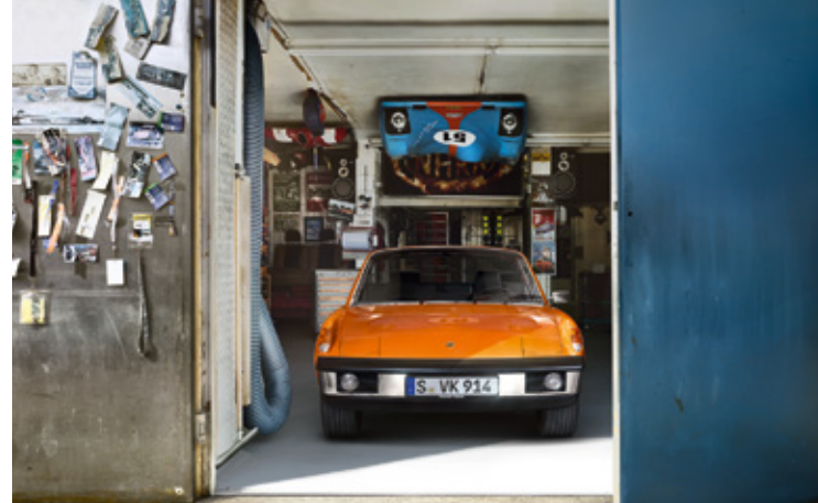
914 Model years: 1970–1976, examples produced: 118,982, available part numbers: 1,700