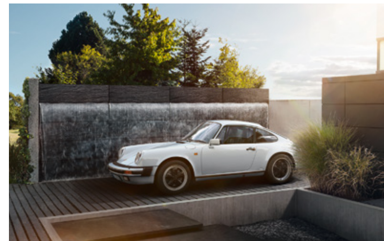
911 G Model years: 1974–1989, examples produced: 196,397, available part numbers: 7,100