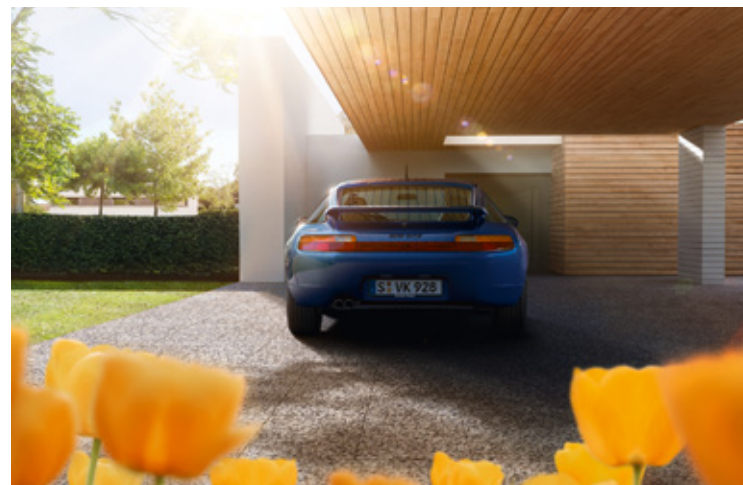
928 Model years: 1978–1995, examples produced: 61,056, available part numbers: 8,500