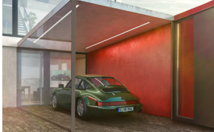
964 Model years: 1989–1994, examples produced: 63,762, available part numbers: 5,900