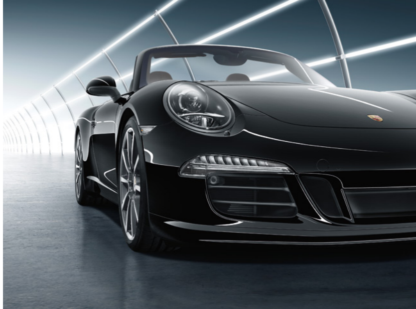
SportDesign front apron