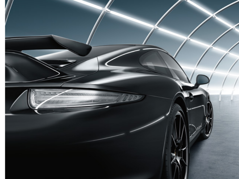
Taillights in clear glass look