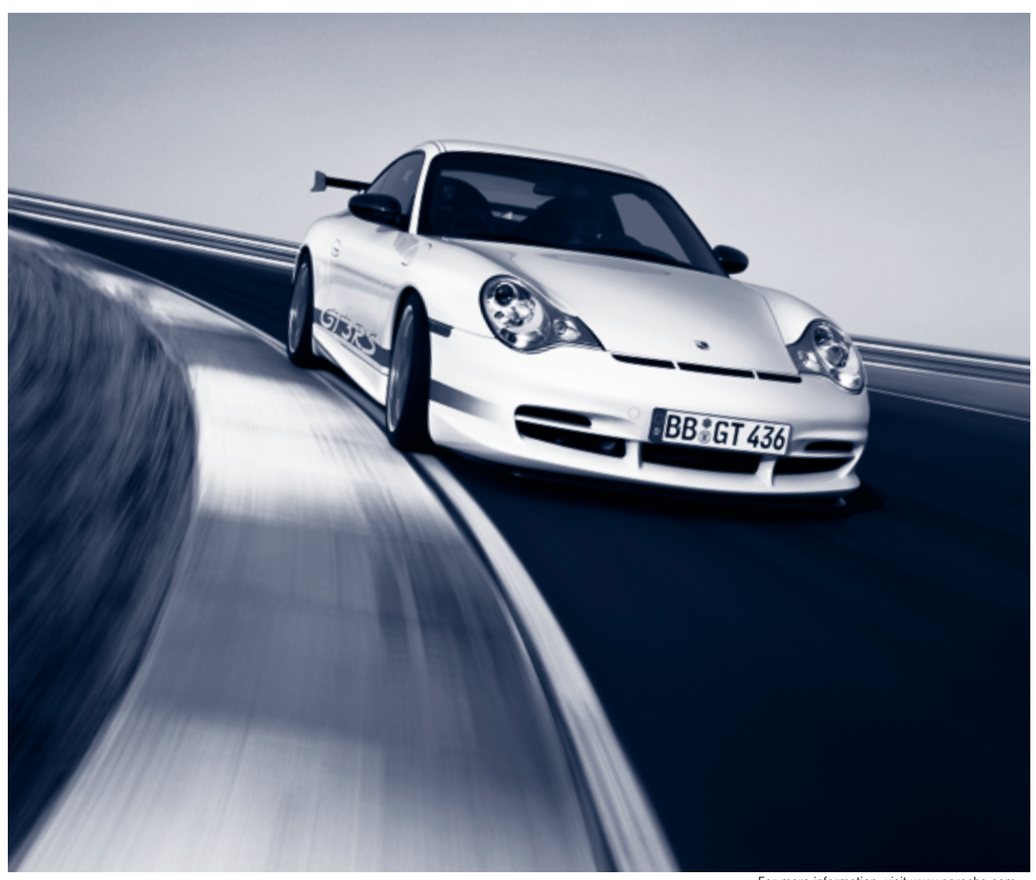
For more information, visit www.porsche.com.

At Porsche, we're dedicated to evolution of our sports cars. And your driving skills.