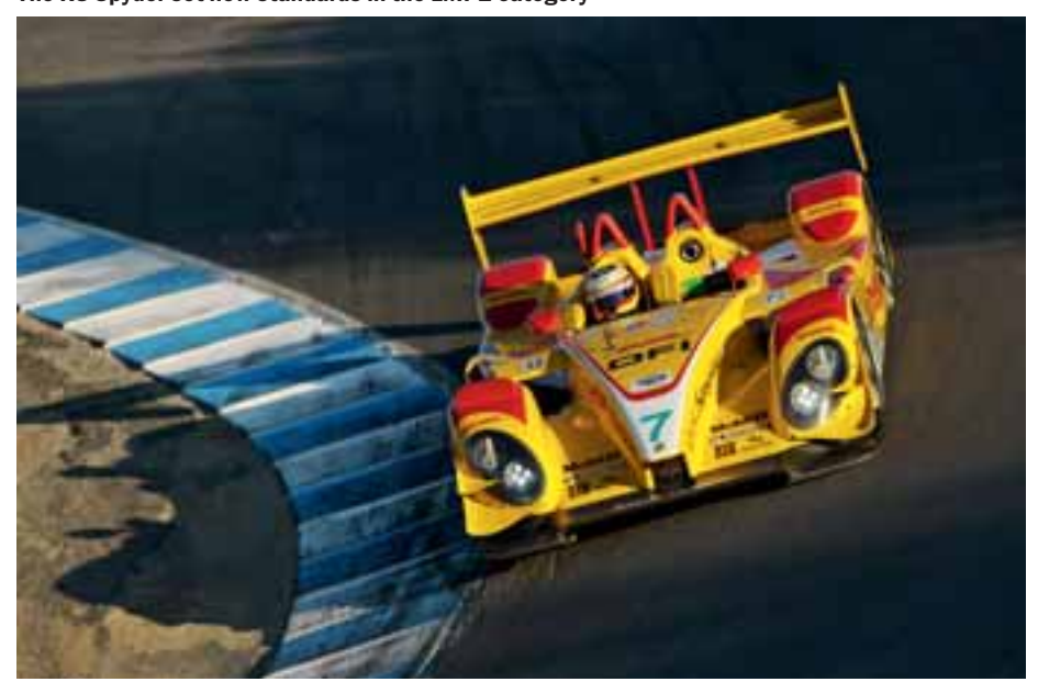
The RS Spyder set new standards in the LMP2 category

The poster celebrating the first Porsche victory