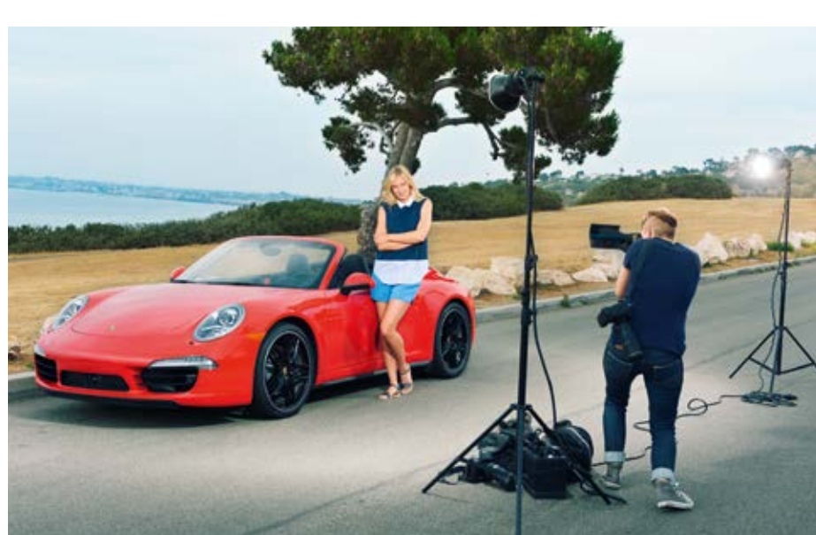
The model, the 911, and the photographer: Setting the scene in Los Angeles

Right now you're involved in work on films for Porsche here in Los Angeles. Do you like being in the limelight? I enjoy having different experiences. It's a