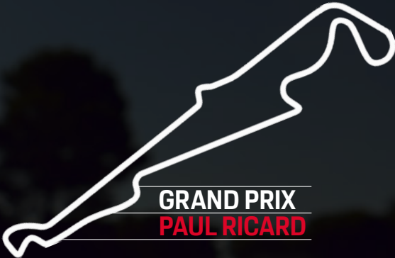
GRAND PRIX PAUL RICARD

It may not be steeped in tradition, but it does have a place in the history books: in 2008, Singapore was given the green light for the first Formula 1 race to be held at night. 1,500 spotlights illuminate the spectacle of the Marina Bay Street Circuit, covering 5,063 kilometres. The course is fascinating with the nocturnal magic of the Asian metropolis and the many 90-degree bends, which expose tyres and materials to extreme stress. A constantly changing grip level and tropical temperatures make the Singapore Grand Prix a real challenge.