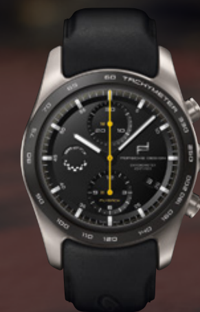
Chronograph 911 GT3 with Touring Package

The search for peak performance requires a solid foundation. Find it in the chronograph 911 GT3 with a high-quality case made from lightweight, durable, high-tech titanium. And it only takes a look under the 'bonnet' to see that this timepiece was inspired by a champion. The Porsche Design WERK 01.200 has a flyback function that combines start, stop and reset into a single process, making the Chronograph 911 GT3 the perfect companion on the race track. The movement is COSC certified – a title awarded only to the most accurate watches. It is powered by a winding rotor derived from the 911 GT3 wheel, which is optionally available in six designs to match the car configuration. Each rotor cap is finished with a distinctive fastener that features the 'GT3' logo in silver colour.