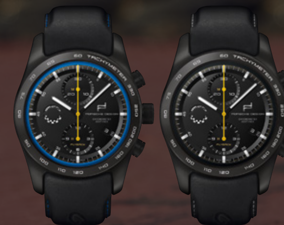
Chronograph 911 GT3