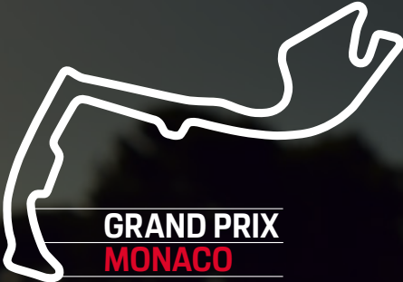
GRAND PRIX MONACO

Where better to imagine a 911 GT3 than on a race track? So, we have selected three spectacular courses for you, where the ,newcomers' can show off their strengths to the max in tight corners and long straights. Jump in and join us for a few fast laps and thrilling seconds on the race track.