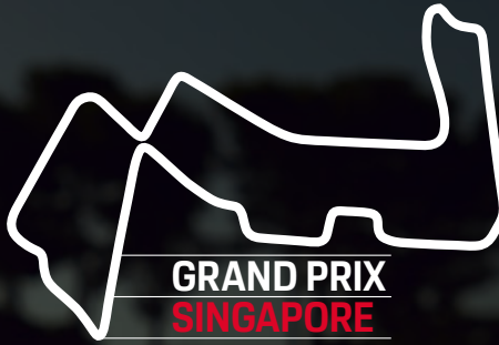
GRAND PRIX SINGAPORE

The Grand Prix de Monaco is considered to be one of the three crowns of motorsport, alongside the Indianapolis 500 and the 24h of Le Mans. The winding track in the Monegasque principality is the mother of city circuits. The story of the Monaco Grand Prix began in the 1920s, but it really took off in 1955 when it became a permanent feature in the Formula 1 racing calendar. Although the average speed of approximately 150km/h through the narrow streets of Monaco is relatively low, the glamour factor is higher than any other city in the world.