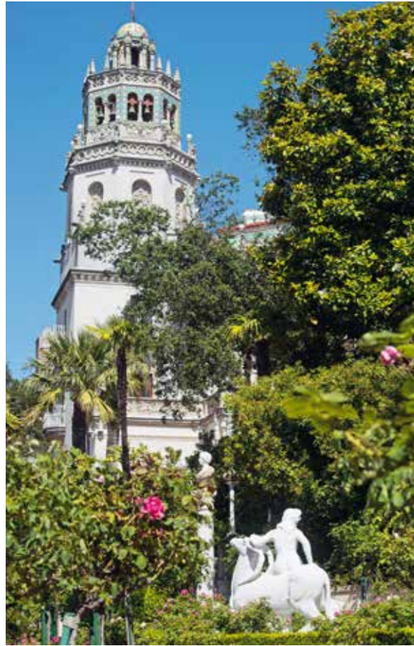
Hearst Castle basks in the radiant Californian sunshine.