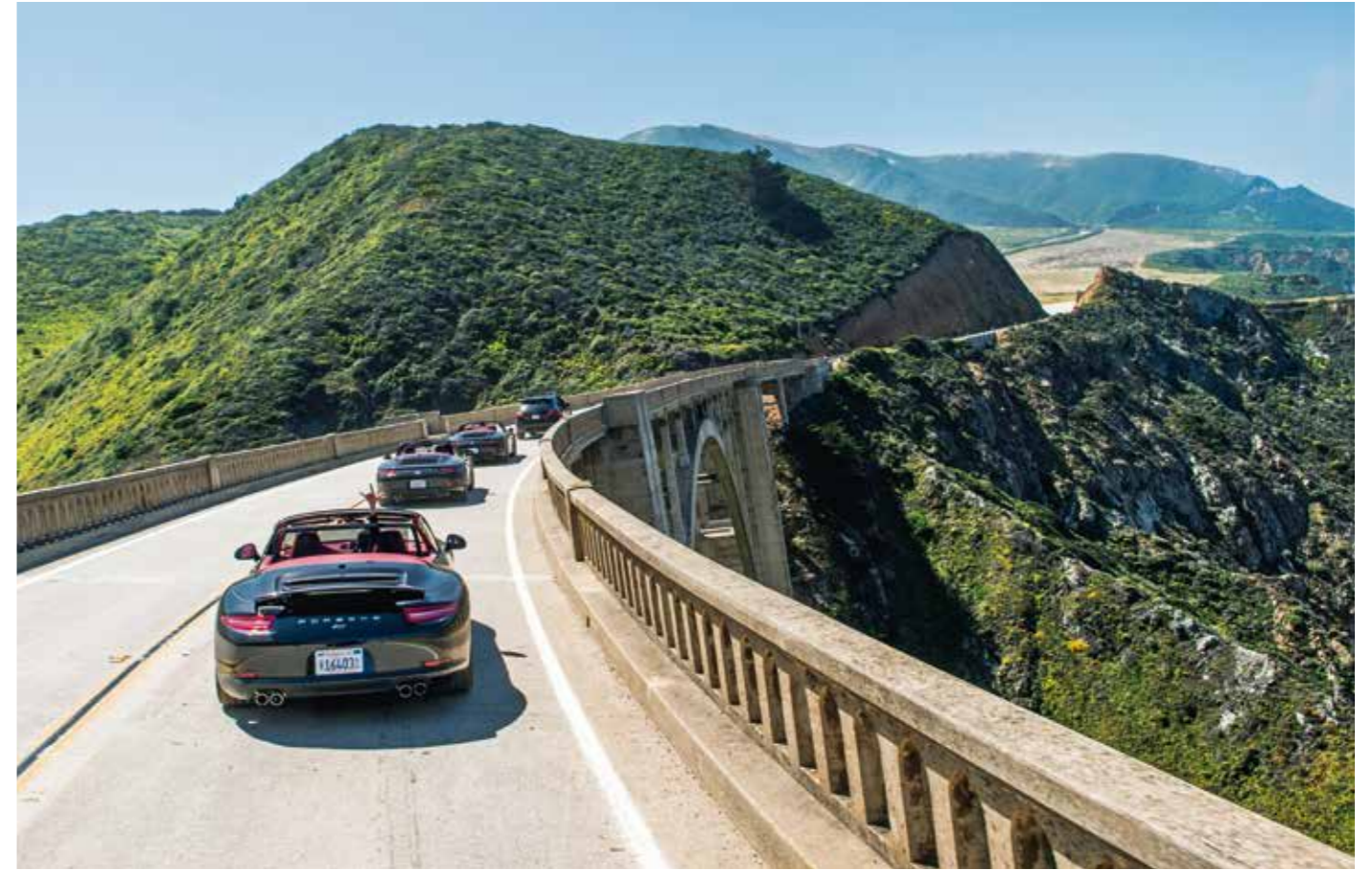
The fleet of Porsche 911 cruises along the spectacular Bixby Creek Bridge.

particular highlight of the trip. "I've been very impressed with Hearst Castle, its very beautiful. So far the driving experience has featured many more highlights than I had expected! The Porsche team is also very professional and kind hearted and I would like to try other routes in the future".