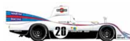
1976 PORSCHE 936 JACKY ICKX - GIJS VAN LENNEP 4,769.923 km at 198.746 kph