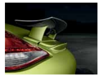
Find out more about the Cayman R at: www.porsche.cn