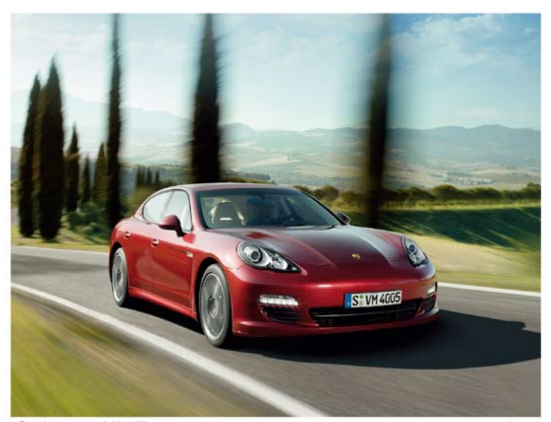
Porsche recommends Mobil III

On 7 November 2010, Porsche will race the 911 GT3 R Hybrid at the season final of the new Le Mans International Cup, the six hour race in Zhuhai. Don't miss your chance to witness the finest in Porsche Intelligent Performance in action on the racetrack.